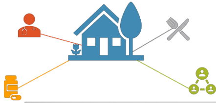
Number of Referrals Sent to Each Action Team as of 5/6